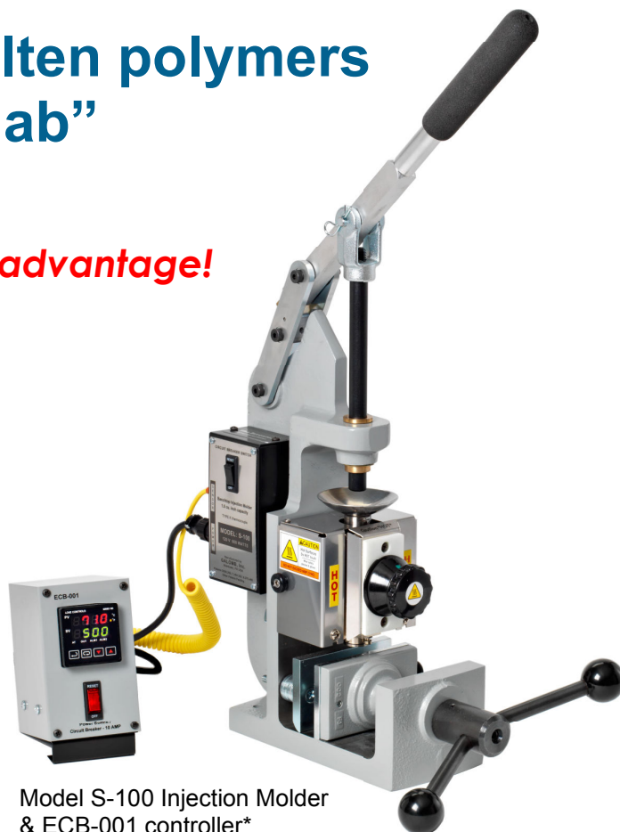
Model S-100 Injection Molder & ECB-001 controller*