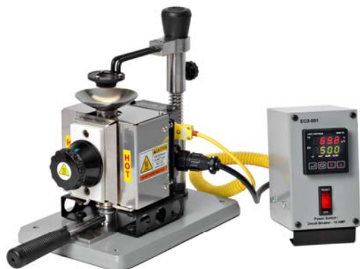
Model M-100 mixing device & ECB-001 controller*